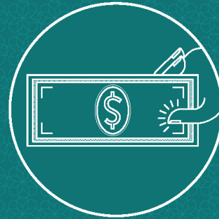
Feel the paper