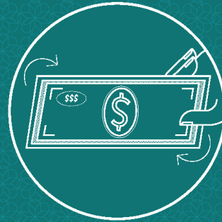
Tilt the note