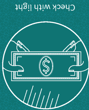
Check with light